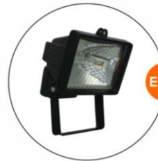
E-04 泛光燈(小太陽) Halogen floodlight 300W