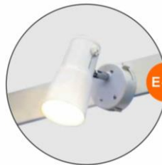
E-01 射燈(白色) Spotlight (White) 23W